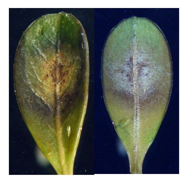
Figure 14. Upper leaf surface with lesion (left) and sporulation on lower leaf surface (right).