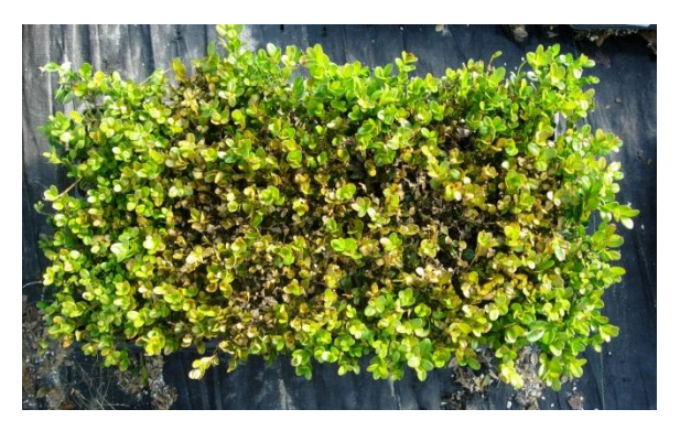
Figure 10. Boxwood blight symptoms in a propagation flat.