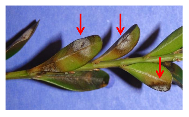
Figure 13. Sporulation of the fungus on undersurfaces of symptomatic leaves (arrows).

Boxwood blight spores are splash-dispersed and can be carried by wind or wind-driven rain over short distances. Longer distance spread is thought to occur through the activities of humans (e.g., contaminated boots, clothing, and equipment), animals, and birds, since the spores are sticky.