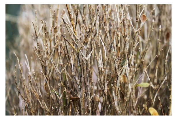
Figure 12. Close-up of dieback and defoliation associated with black stem cankers.

Sporodochia contain large numbers of sticky, cylindrical spores (conidia), which give the sporodochia an angular or crystalline appearance (Figure 17). Structures of the fungus called vesicles form in the sporodochia and protrude from the main fruiting body (Figures 17 and 18). Spores (conidia) are cylindrical and hyaline, and usually have one septation (Figure 19).