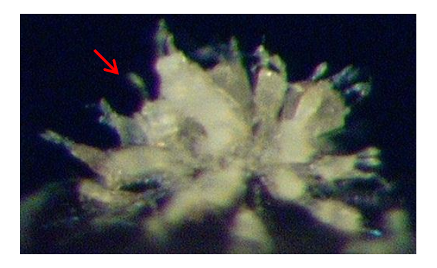
Figure 17. Angular appearance of spore clusters with many protruding vesicles (arrow).

The boxwood blight pathogen has a rapid disease cycle that can be completed in one week. It has a temperature range of 41-86 °F. The optimum temperature for growth is 77 °F. The fungus is sensitive to high temperatures and is killed after 7 days at 91 °F. Infections can occur very quickly under warm (64-77 °F), humid conditions.