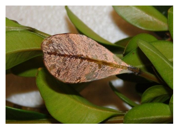
Figure 20. Diagnostic, salmon-colored fruiting bodies of Volutella blight.

(Figure 21). This disease can result in extensive leaf drop.