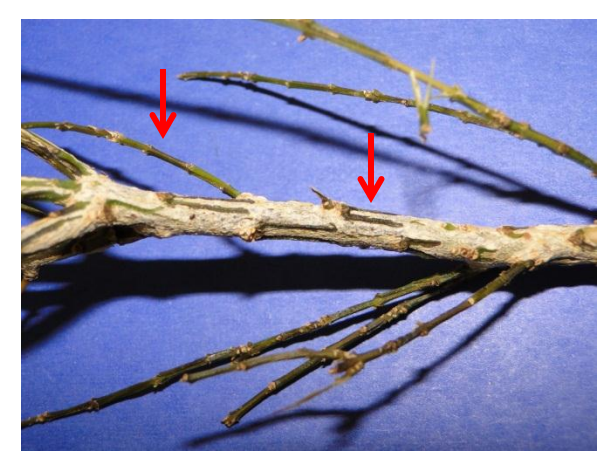
Figure 4. Diagnostic young, developing black cankers on stems (arrows).