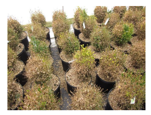
Figure 9. Boxwood blight symptoms in container-grown plants. Note extensive leaf debris in the pots and on landscape fabric.