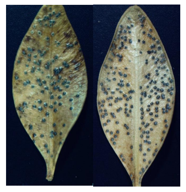
Figure 21. Diagnostic symptoms of Macrophoma leaf spot (left, upper leaf surface, right, lower leaf surface).

Boxwood decline is associated with root damage by root-knot nematodes ( Meloidogyne and Pratylenchus ). Plants often undergo progressive decline over a period of several years. Symptoms include stunting, wilting, loss of vigor, and chlorosis. Some bronzing of internal foliage can occur. Depending upon the nematode, root symptoms include formation of swollen