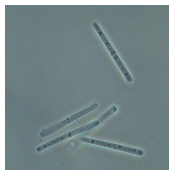
Figure 19. Photomicrograph of cylindrical, twocelled spores of the boxwood blight pathogen.

The boxwood blight fungus does not require a wound to infect, since it can penetrate directly through the plant cuticle or can enter the leaf through stomata. High humidity levels or free water on plant tissues are necessary for successful infection.