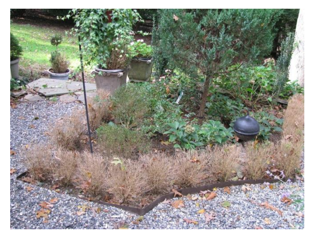
Figure 6. Seven-year-old planting of boxwood infected with blight.