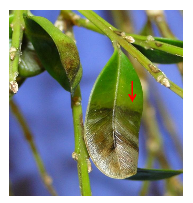
Figure 3. Blighting of leaves. Lesions often have a concentric pattern or a "zonate" appearance (arrow).