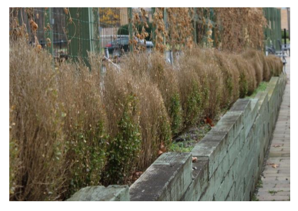
Figure 7. Established planting of boxwood with symptoms of boxwood blight.

Boxwood blight can also be a very serious problem in commercial production settings, because the conditions are highly favorable for infection—many susceptible plants are grown in close proximity in a field or pot-topot in a hoop house, levels of humidity are often high, plants are often watered overhead, and leaf debris is abundant (Figures 8, 9, 10, 11, and 12).