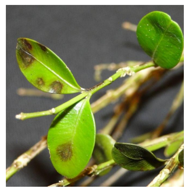
Figure 2. Initial symptoms appear as dark or light brown spots on the leaves.

attempts to regrow, repeated infection and defoliation can weaken the root system and lead to plant death, especially for young plants or new transplants.