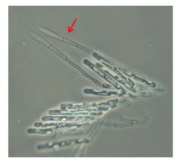
Figure 18. Photomicrograph of distinctive protruding vesicles (arrow) and cylindrical spores.

The boxwood blight pathogen has a rapid disease cycle that can be completed in one week. It has a temperature range of 41-86 °F. The optimum temperature for growth is 77 °F. The fungus is sensitive to high temperatures and is killed after 7 days at 91 °F. Infections can occur very quickly under warm (64-77 °F), humid conditions.