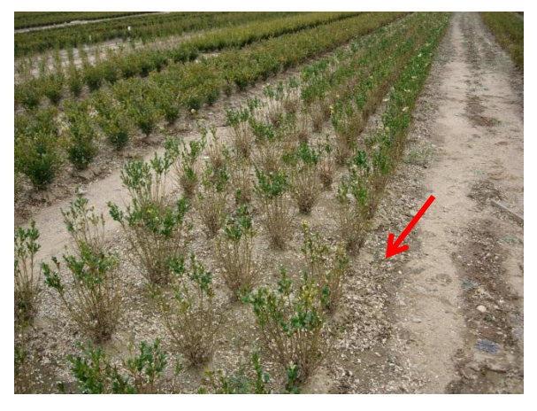
Figure 11. Field-grown boxwood plants with symptoms of boxwood blight (note leaf debris, arrow).