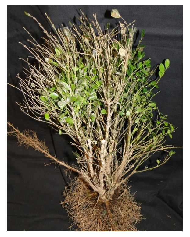
Figure 1. Symptoms of boxwood blight on a boxwood from a landscape planting.

In October 2011, samples of boxwoods with unusual symptoms were submitted to The Plant Disease Information Office of the Experiment Station for diagnosis. Symptoms included leaf spots and blights, rapid defoliation, distinctive black cankers on stems, and severe dieback (Figure 1).