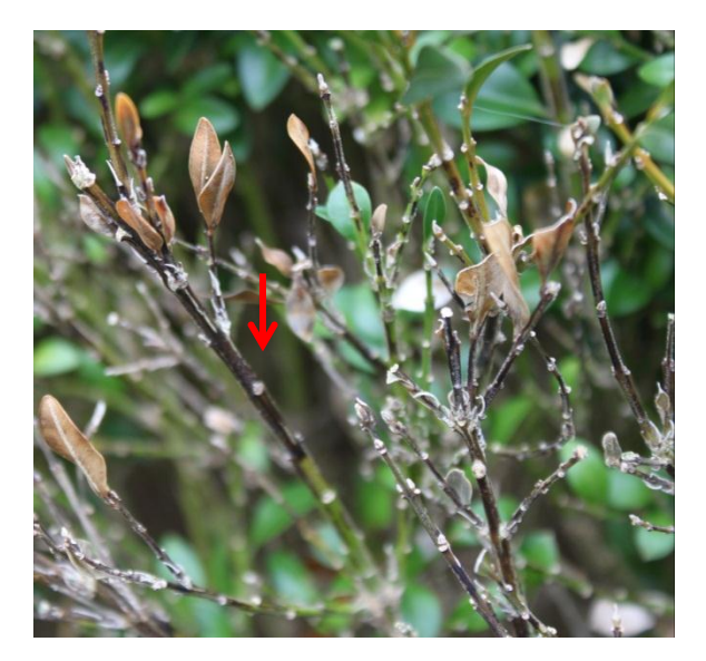
Figure 5. Dieback on stems girdled by coalesced, black cankers (arrow).

Boxwood blight can spread very rapidly under warm and humid conditions. For example, in 2011 we have seen several examples of established boxwood plantings in Connecticut landscapes that were apparently killed in one season following the introduction of infected plants—2011 was a particularly cool, wet year that included several violent rain events (Figures 6 and 7).