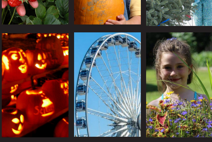
The history and traditions of New Hampshire's rural heritage form the foundation of our state's character. From the beautiful scenery and welcoming community downtowns, to farms and rural industry, the country side of New Hampshire has much to offer. Experience the history and meet many of today's entrepreneurs!