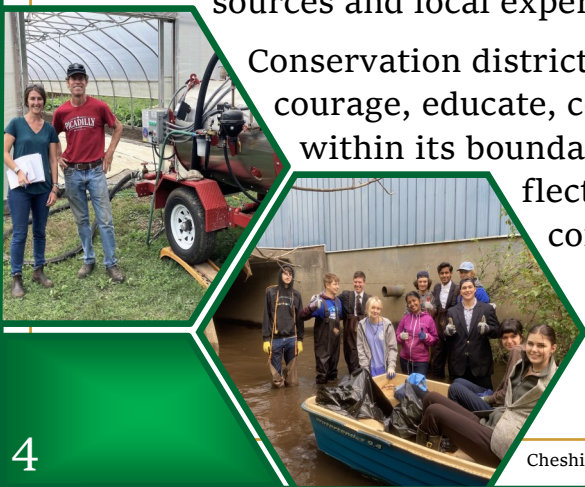
Cheshire CCD- Soil steamer demonstration & “Source to Sea” river clean-up with local high school

Conservation districts can do many things under the state code to encourage, educate, coordinate, and take action to assist the land users within its boundaries, but what actually occurs is often largely a reflection of the dedication, vision, and commitment of conservation district supervisors and staff.