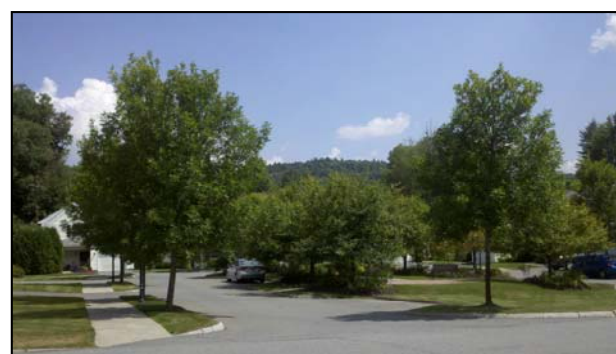
Ash-lined neighborhood in Lebanon, NH.

Although you cannot control the arrival of emerald ash borer on your property, you can decide what impact emerald ash borer will have by developing an emerald ash borer plan. This should be done regardless of proximity to known emerald ash borer populations. The first step is to stay informed about known emerald ash borer populations in the state ( www.nhbugs.org or follow NH Bugs on facebook). Next, determine if you have ash trees, what size they are, where they are located, and if they add value to your property or community. Use local foresters and arborists, on-line calculators ( www.extension.entm.purdue.edu/treecomputer/ and other sites) or smart phone apps (ARBORJETP for iphone and ipad and others) to estimate the costs associated with tree removal, replacement or treatment. Once you have determined your investment in ash and considered your budget, you can develop a plan for which trees will be removed, replaced or treated with insecticides when emerald ash borer arrives. Having a plan empowers you to make informed decisions about your property or community.