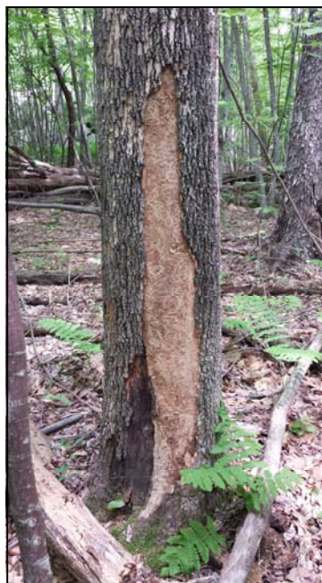
Emerald ash borer killed tree in Concord, NH.