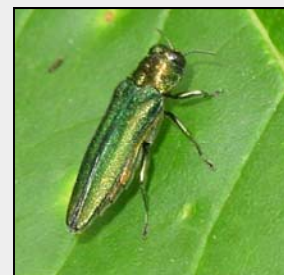
Emerald ash borer adult

The problem: Emerald ash borer is an introduced and destructive pest of all North American true ash ( Fraxinus ) such as white, green, and black/brown ash. Trees infested with emerald ash borer will die from the infestation within 3-5 years unless treated. Management strategies to slow the spread of ash mortality can reduce overall emerald ash borer populations, but they may not save the ash tree in front of your house or in your park. Potential costs associated with emerald ash borer for municipalities and homeowners include: