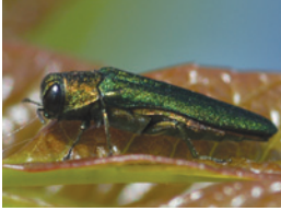
EAB adults must feed on foliage before they become reproductively mature.

The basal trunk spray offers the advantage of being quick and easy to apply and requires