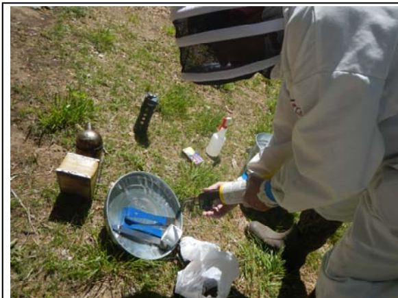
Decontamination of inspection tools.