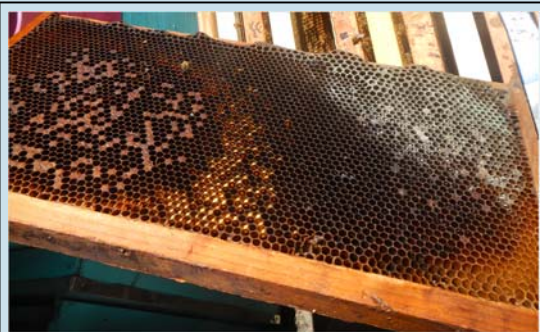
AFB-infected comb with mold on AFB scale.